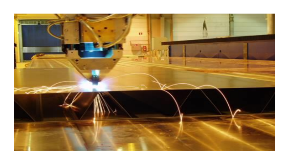
Laser3 - welding of metallic lightweight sandwich panels

ECMAR can offer added value in this field, through developing policies from leading edge in-house expertise and the awareness of trends in research and innovation - from a broad overview of the research area, and from the knowledge both of the available technologies and the market needs.