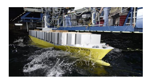
Model tests of Emma Maersk , one of the largest containerships

ECMAR's role within a wider European and global maritime research environment is to focus on applied research, making the link between basic research undertaken by universities, and its exploitation by industry. ECMAR member organisations are well placed to respond to market and societal needs through research, as they have extensive experience in applied research and in technology transfer.